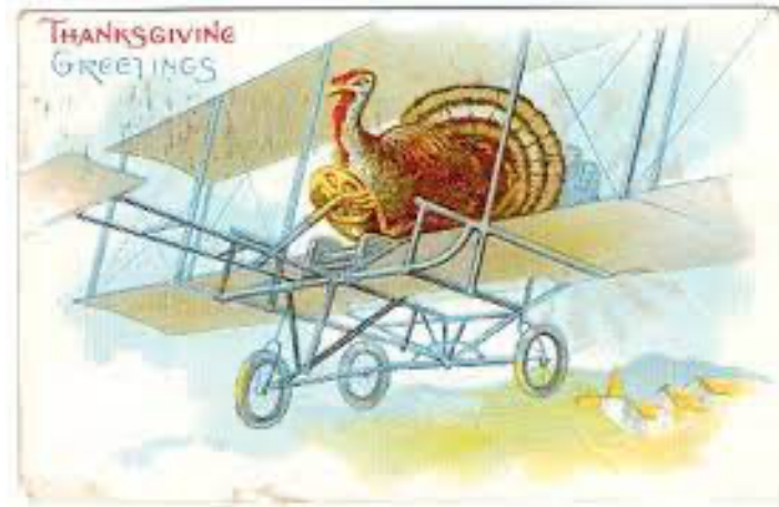
This Turkey has the Wright stuff!