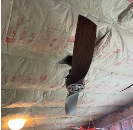
New fan and controller!