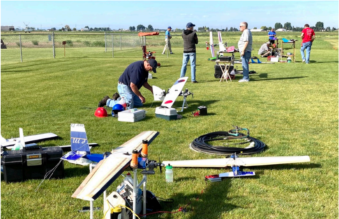
Morning flight line set up at The Turkey Shoot in Idaho Falls, June 10, 2023.