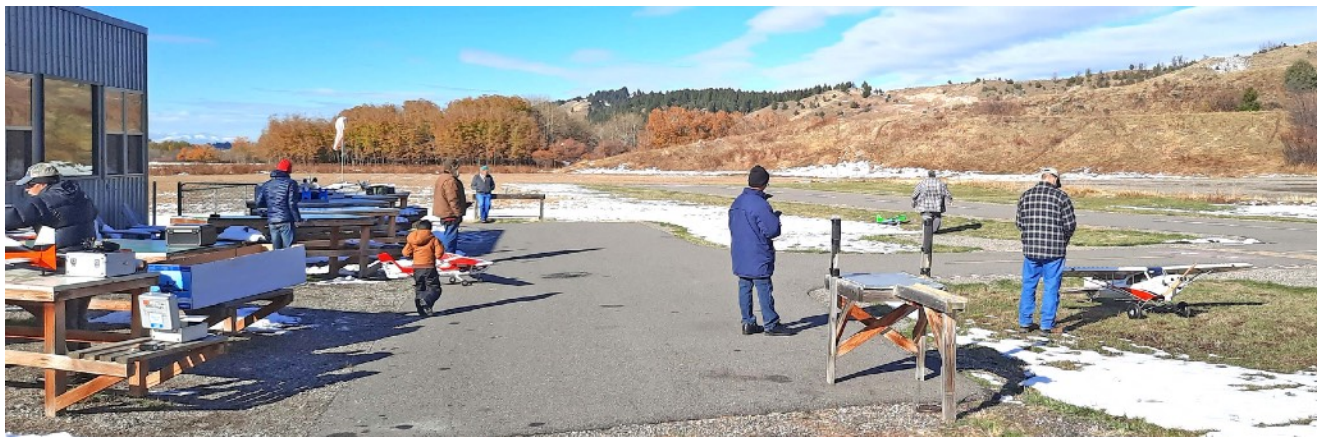
Our field Saturday, Oct 29