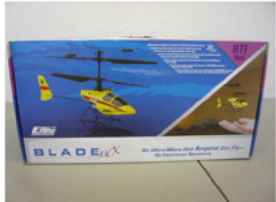
Eflight Blade MCX $30.00