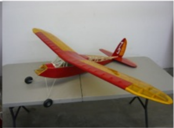
68 inch 3 Chan. Air Frame $40.00