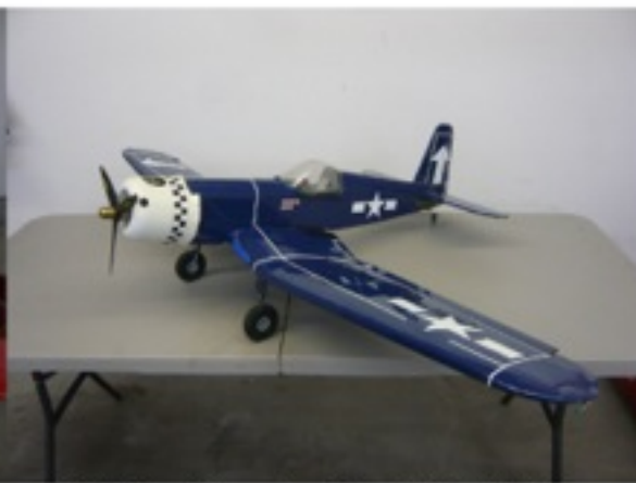
61" Balsa Corsair w Royal 40 $100.00