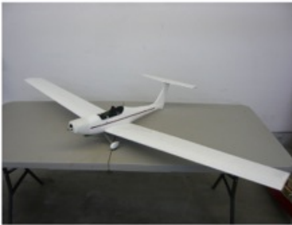
Kyosho Valencia 1800 Plastic Body $50.00