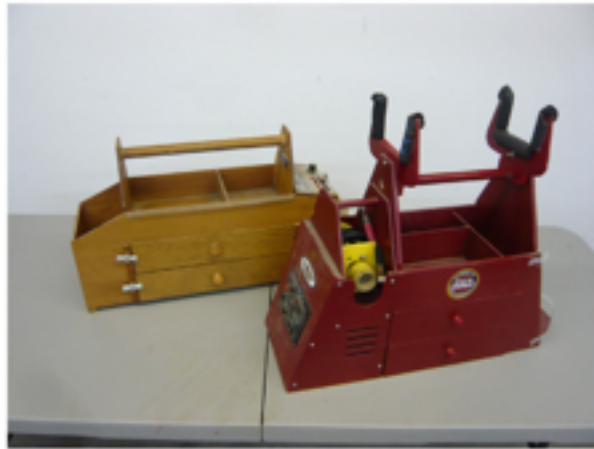
Wood Field Boxes $25.00 Each