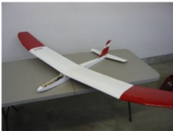
78" Spirit Sail Plane Missing Cover $50.00